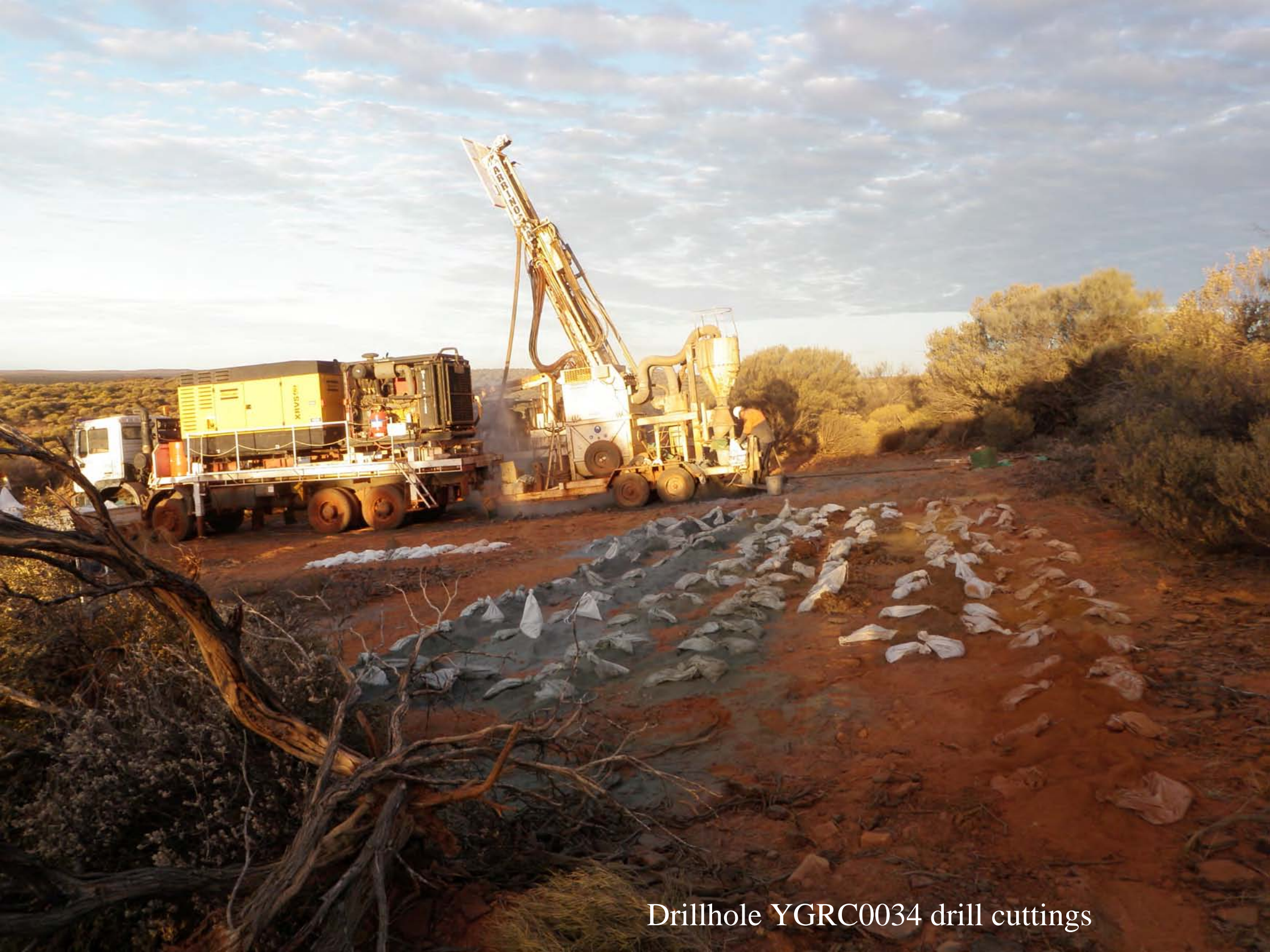
Drillhole YGRC0034 drill cuttings