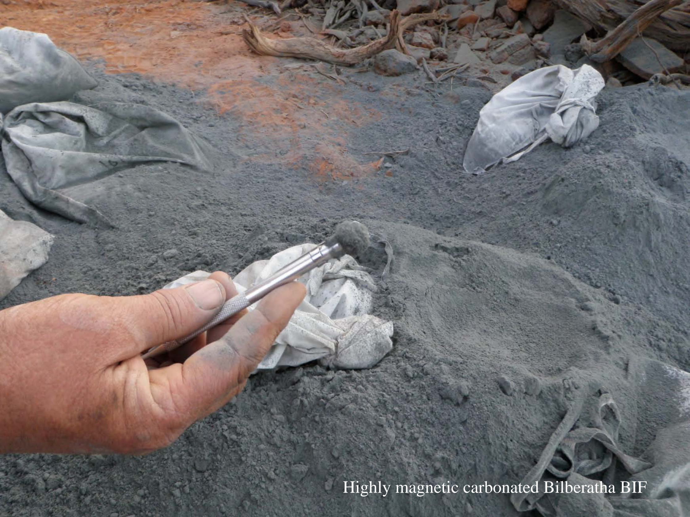
Highly magnetic carbonated Bilberatha BIF