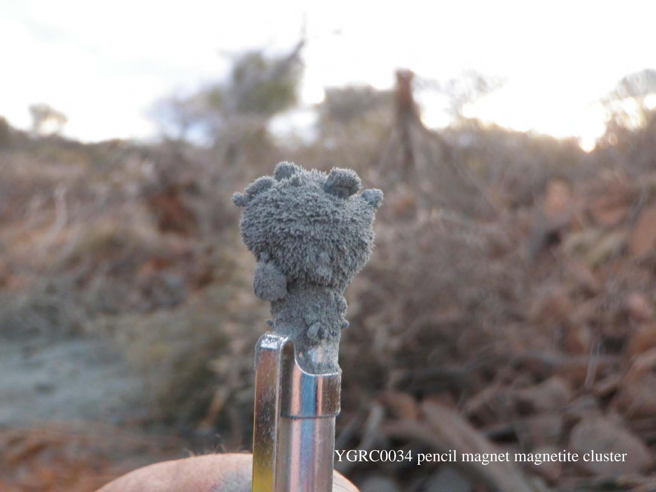
YGRC0034 pencil magnet magnetite cluster