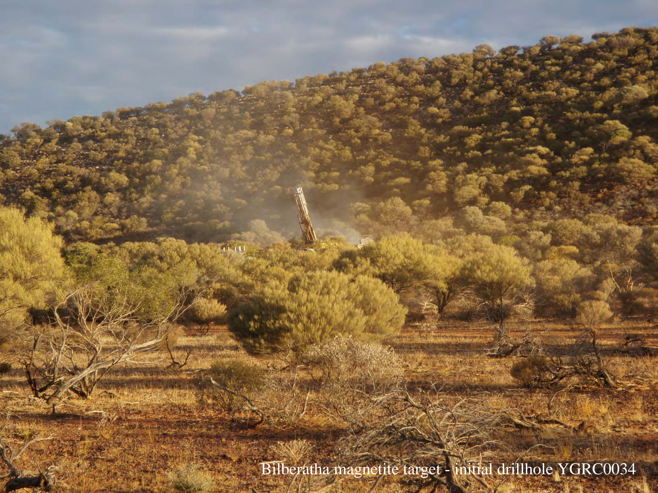
Bilberatha magnetite target - initial drillhole YGRC0034